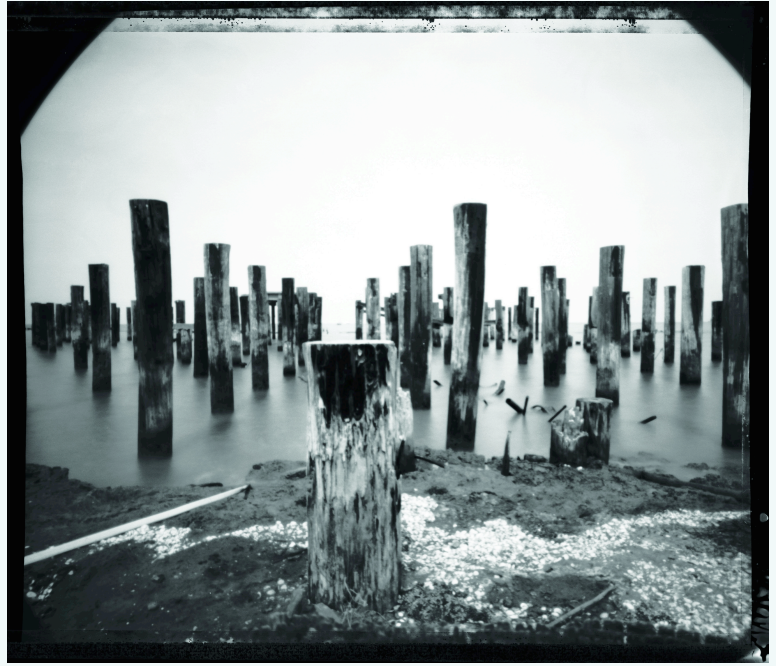
Pylons, Sulfur Mine Island, Louisiana