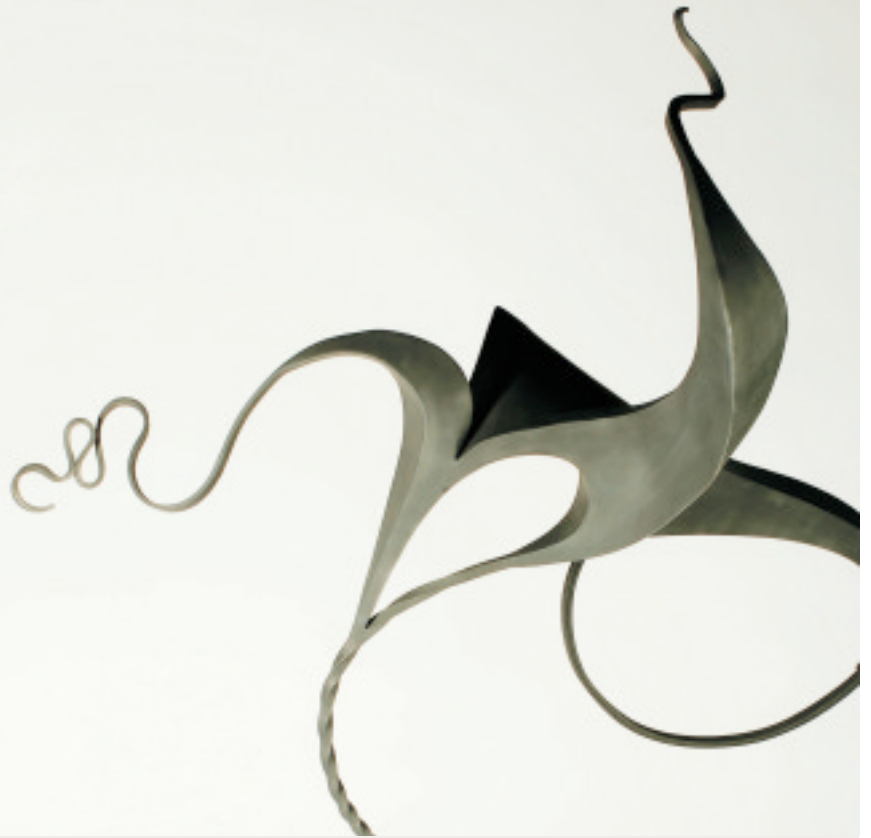
Podform Evolution by Luke Achterberg (Master Pieces)