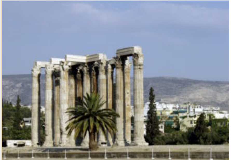
2001 study trip - Athens, Greece

Finally, if you selected a gift option upon registering your membership, you will be receiving your premium within the next month with the exception of the NDA 2006 which will not be available until that project is complete. Once again, welcome, and thank you for joining us for season 3!