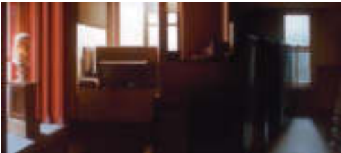
aaron brown museology 7