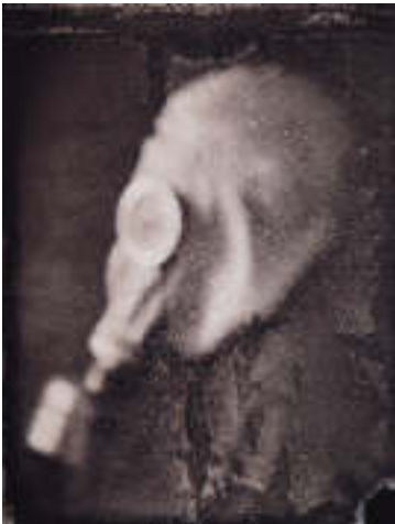
jeannette palsa species collodius gasmaskus