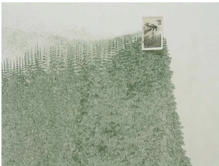
Andrea Moreau, (Columbus, Ohio), Poland (Evergreen Forest) , postage stamp and colored pencil on paper and wall, 2005 (detail)