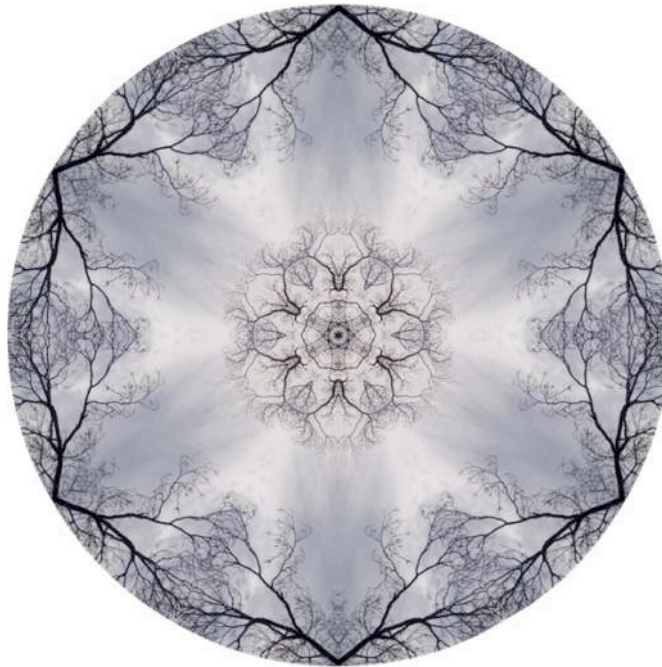
Allison Trentelman, (Belfast, Maine), Mandala 461 archival inkjet pigment print, 12" x 12", 2005