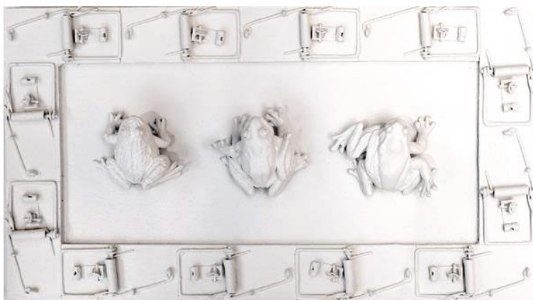
Susan Kirby, (Middle Village, New York), White Rats , acrylic, plastic, and traps on wood, 10" x 17" x 2", 2003